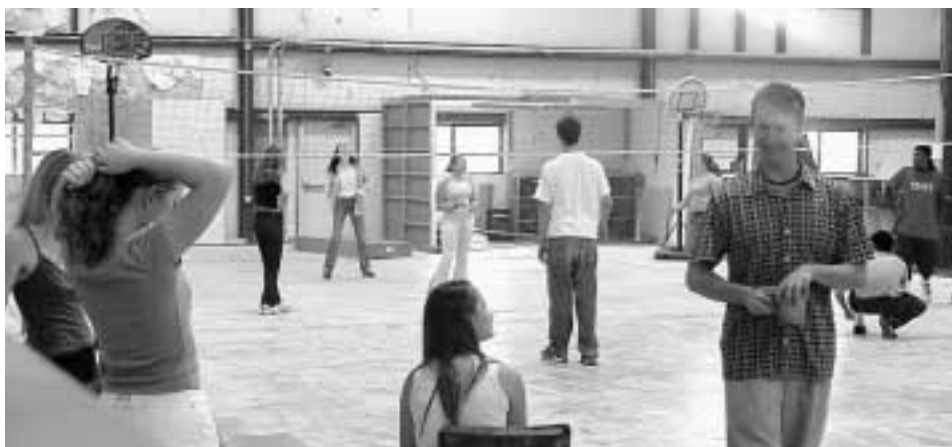
Volleyball at KAPS

Featured in the school's scrapbook are student surveys, editorials, reports, and artwork, all available in the school's lobby for perusal by visitors. Past service projects are illustrated with photos showing students participating in