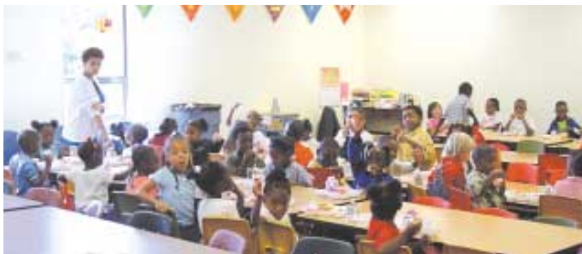
It's lunch time at Rapoport Academy.

Parents, public schools, and community businesses have breathed life and vigor into these two successful, growing charter schools. Parents in the low-income subsidized housing